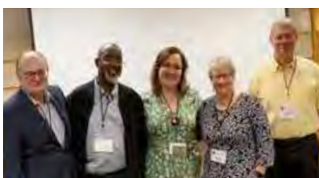
Unity Synod 2023 - Cape Town, South Africa