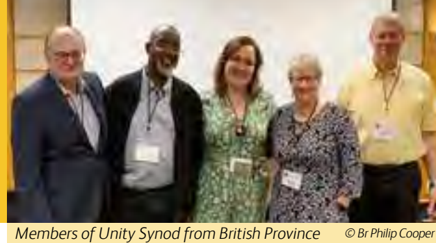
Members of Unity Synod from British Province

Unity Synod 2023 took place from Monday 4th to Sunday 10th September, at the Garden Court Hotel, in Cape Town, South Africa.