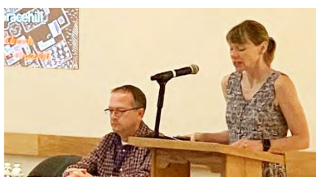
The 8th Bethlehem Conference on Moravian History and Music