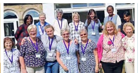
Report from the Moravian Women's Association (MWA) Retreat