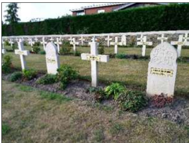
Christian and Muslim graves in Poperinge New Military Cemetery, Belgium